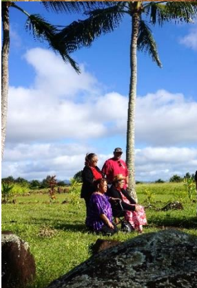
Mahalo nūnui Kamalani Academy